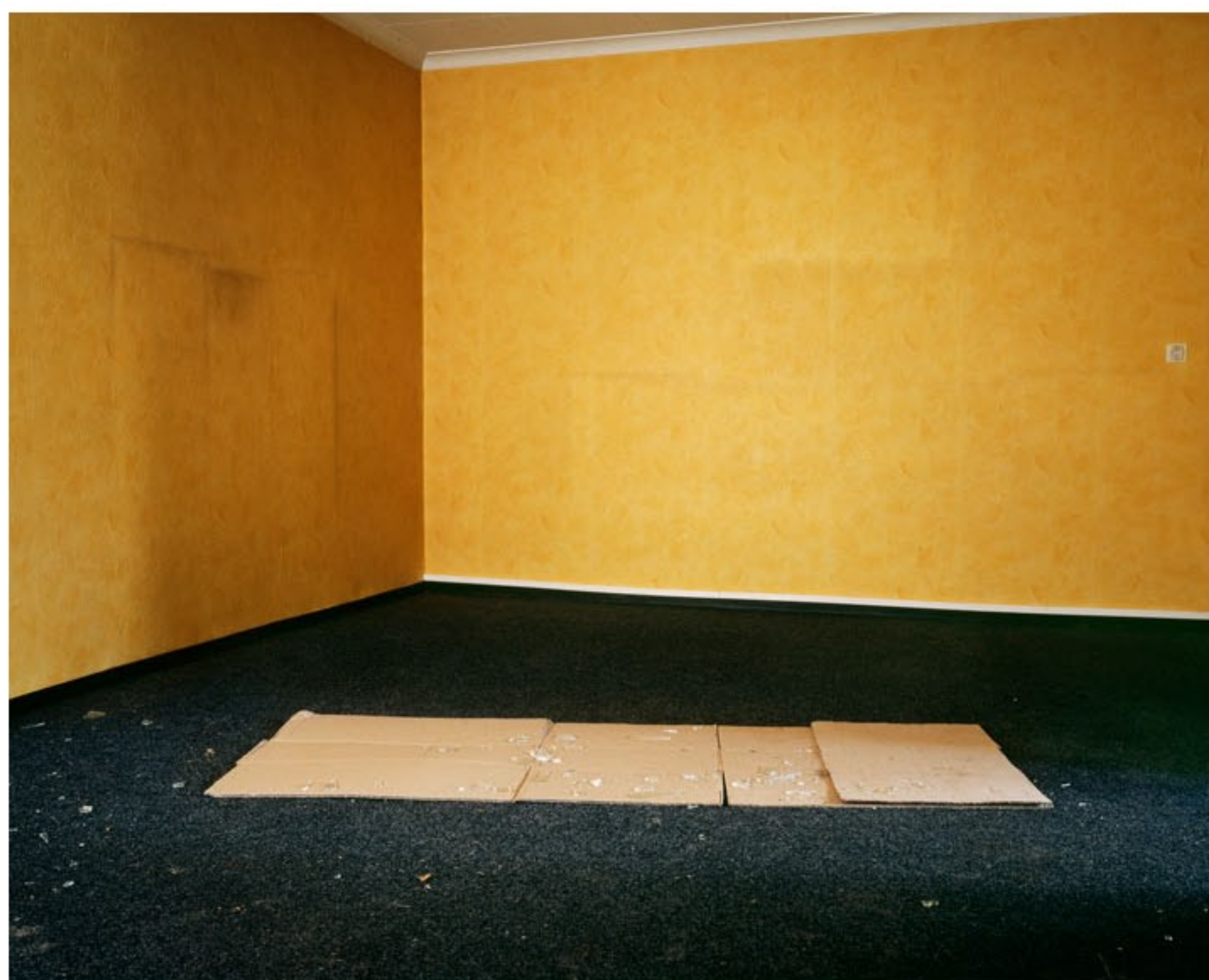
Empty Box, 2010 From the series 'Unsettled (2007-2012)'

By private_ | March 12, 2013 | Posted in Photo exhibition